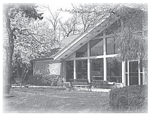
Livonia & Wayne Chapels

SNORE? TIRED? SLEEP APNEA? CPAP INTOLERANT? ALTERNATIVE TO CPAP.